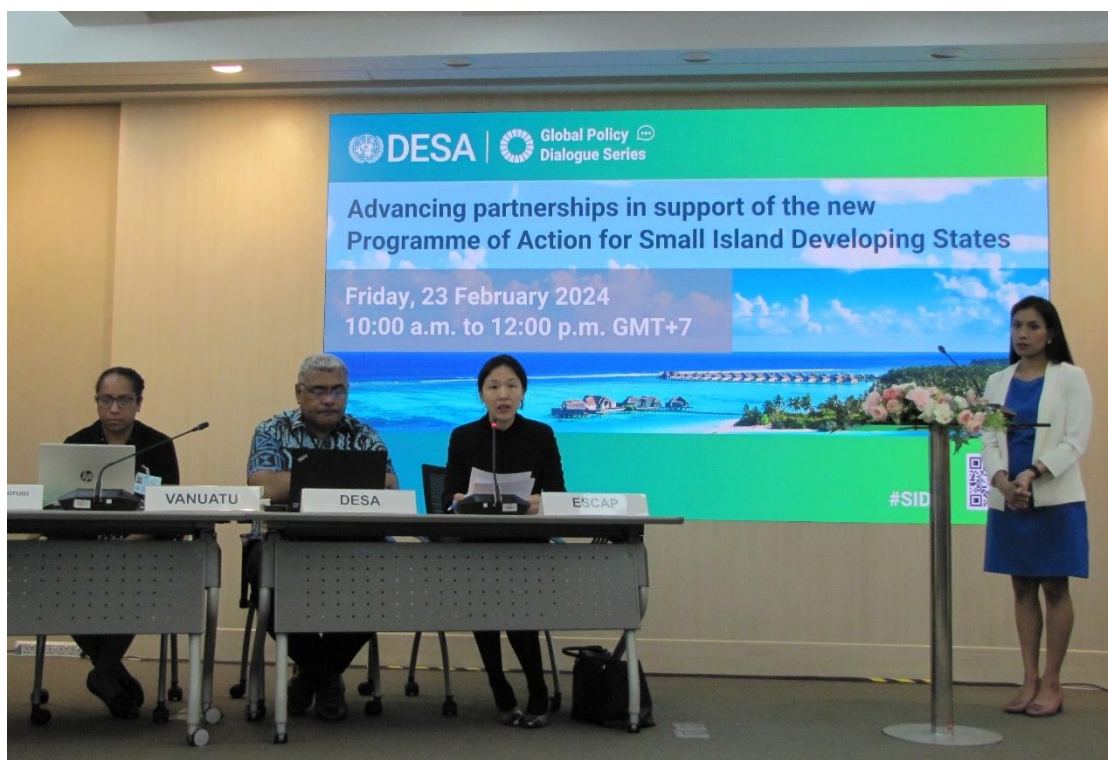
Delegates participate in the SIDS Partnership Symposium in Bangkok, Thailand, in February.