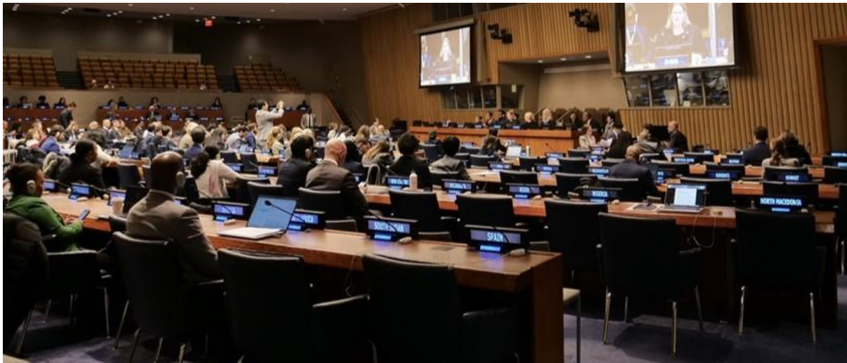
Delegates participate in the First Preparatory Committee meeting for the SIDS4 Conference in January.